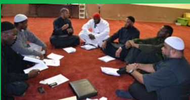
First Meeting of the National Board