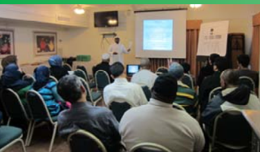
First Meeting of MAR2 Members & Supporters